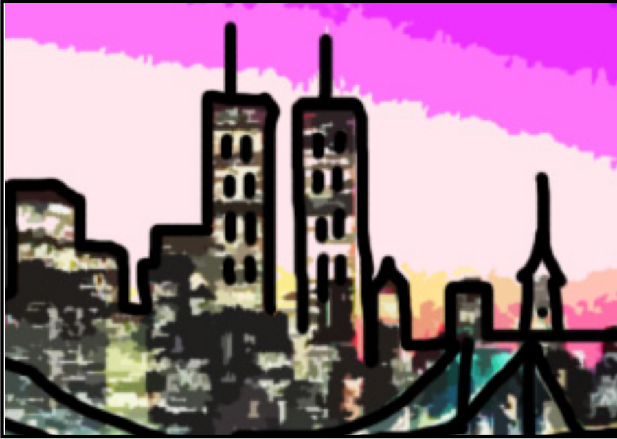
EXTREME WIDE SHOT

AN EXTREME WIDE SHOT GIVES AN OVERVIEW OF THE SETTING. IT IS OFTEN THE SHOT USED IN THE FIRST PANEL AND IS USED TO SITUATE THE STORY. IT IS SOMETIMES CALLED A PANORAMIC SHOT.